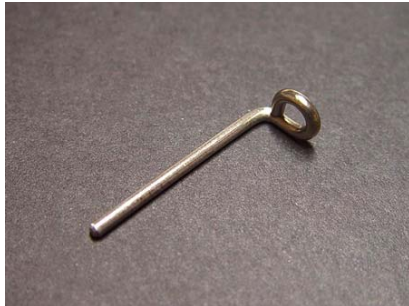
Bent the wire as shown.