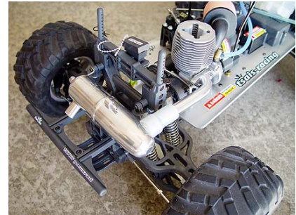
Install the pipe.