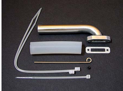
Kit includes pipe, manifold, mounting accessories and logo decal sheet.