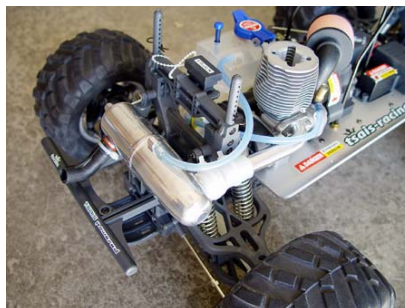
After securing the pipe and deflector, install the pressure fitting fuel line...