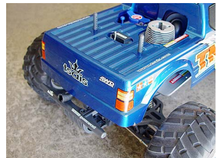
Now put some TSAIS logo decals on your body shell. Time to show off!

Warranty: TSAIS exhaust systems are covered against manufacturer's defects in materials, workmanship or assembly when are new (before been installed). All warranty claims are handled by TSAIS/RCHub in the US, or authorized importers/distributors in your country or region.