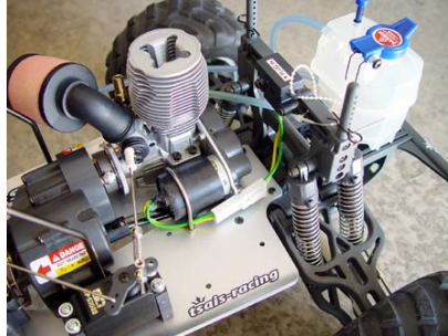
Remove fuel tank.