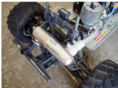
Secure the pipe with zip ties and a M4 setscrew, and then install the stock rubber deflector onto the stinger.