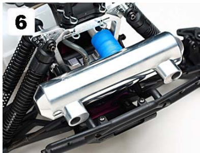
Connect the pressure fuel line, and zip-tie the silicone coupler. Put rear bumper back on. Done!