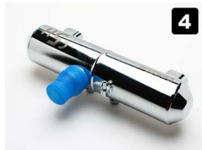
Install the silicone coupler onto the pipe.