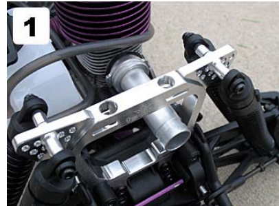
Install the gasket, manifold, and manifold spring.