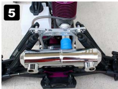
Insert the mounting wires through the brackets on the bottom of the pipe, and connect the manifold to the pipe. Secure the pipe with M4 set screws.