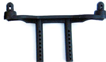
You may need to trim the rear body post to fit your application.